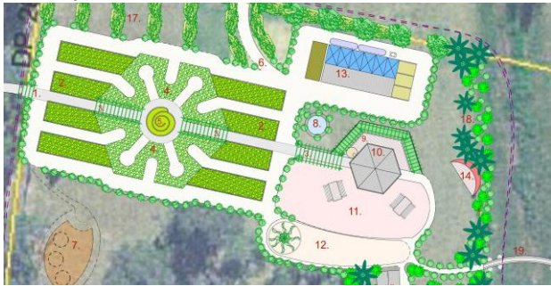
URBAN RENEWAL Plans for Newcastle East & West

Port Macquarie is set for a community garden – plans are currently on exhibition at Council.